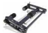
Flange Puller Sets