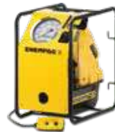
Electric Tensioning Pumps