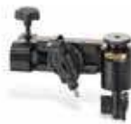
Flange Face Tool