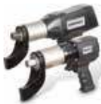
Pneumatic and Electric Torque Wrenches