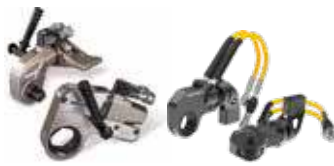
S, W, RSL and DSX-Series Hydraulic Torque Wrenches