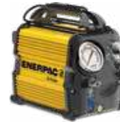
Electric Torque Wrench Pumps