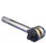
Manual Torque Multipliers