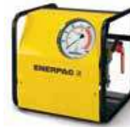
Pneumatic Tensioning Pumps