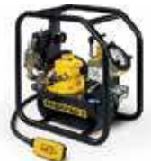
Pneumatic Torque Wrench Pumps