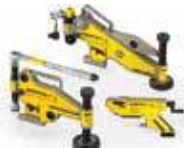
Flange Alignment Tools