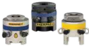
HydraMax, General Purpose and Aquajack® Subsea Tensioners