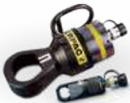
Hydraulic Nut Cutters and Nut Splitters