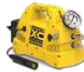
Battery-Powered Torque Wrench Pumps