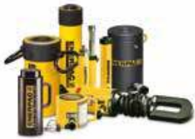
Cylinders & Lifting Products