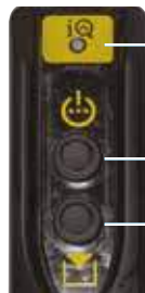
3/2 Jog, 3/2 Dump, 4/3 Jog pendant with 3 metres cord