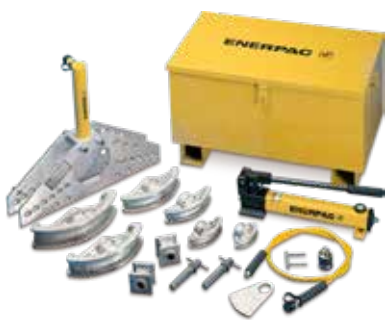
STB-Series, Pipe Benders