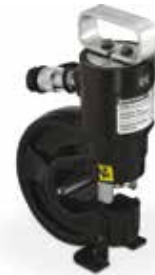
SP-Series, Hydraulic Punches