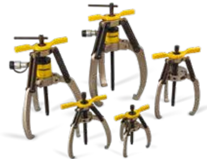
LG-Series, Lock-Grip Pullers