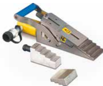
LW-Series, Lifting Wedges