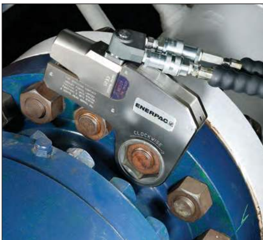
◀ The ZE4 torque wrench pumps are perfectly matched for this W2000X wrench.